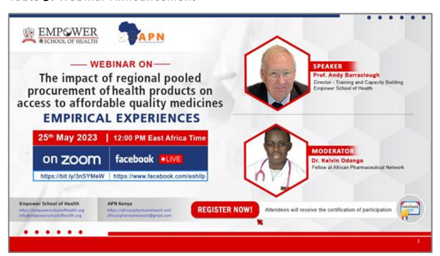
Table 5: Webinar Announcement

Gamification elements are also used to a certain extent, for instance via the use of scenario-based questions. Most assignments are based on real life scenarios. On its website, the institution presents the so-called "Spot the ADR Game". In the game, players will play the role of a community health volunteer and take decisive actions to manage different adverse drug reactions (ADRs). During the digital conference, the institution clarified that the use of gamification elements depended on the Instructional designer's decision in the analysis phase, always keeping in mind the target audience and possible level of gamification. The added value of the tools and technologies, i.e. gamification, is continuously analysed.